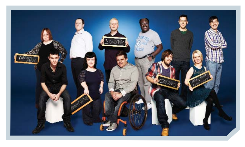
'It was very fulfilling to have a media company, which are in some way responsible for public perception, to be so receptive and able to take on an educative role'

Independent consultation to the production company helped